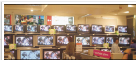
TV Wall wiring

Evaluating music and Video CDs/DVDs is important before purchase. Streme solution links product bar codes into the preview files. A quick scan of the product in hand and the preview starts. You start, stop or skip to the next track. With an ability to store thousands of previews at the store level, you get the customer to browse, select the music or simply see a preview, leading to a sale