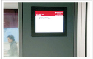
Classroom Activity Displays

Displays outside each classroom show name, and time of the session being conducted in the class. An impressive display for visitors, this enhances the brand image of the institute with a marginal investment.