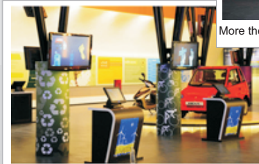
3D LCDs powered by touch screens