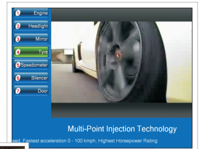
Sensor based auto showroom display

You can now get devices like cameras, 3D Cameras, motion sensors, security and automation devices that can easily be integrated with standard AV equipment like splitters, multiplexers etc. Now dim the lights, draw the curtains with a gesture of the hand! All diverse technologies are integrated with one framework. XMagix. Just feel free to share ideas with us and let's create experiences to remember.