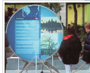
Unusual Displays at Corporate Lobby