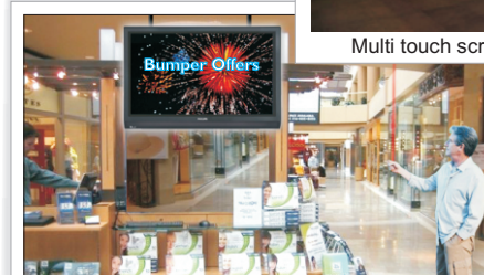
Interactivity Using Light Beams and Sensors