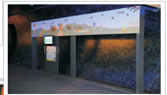
More the LCD on rails to see content change